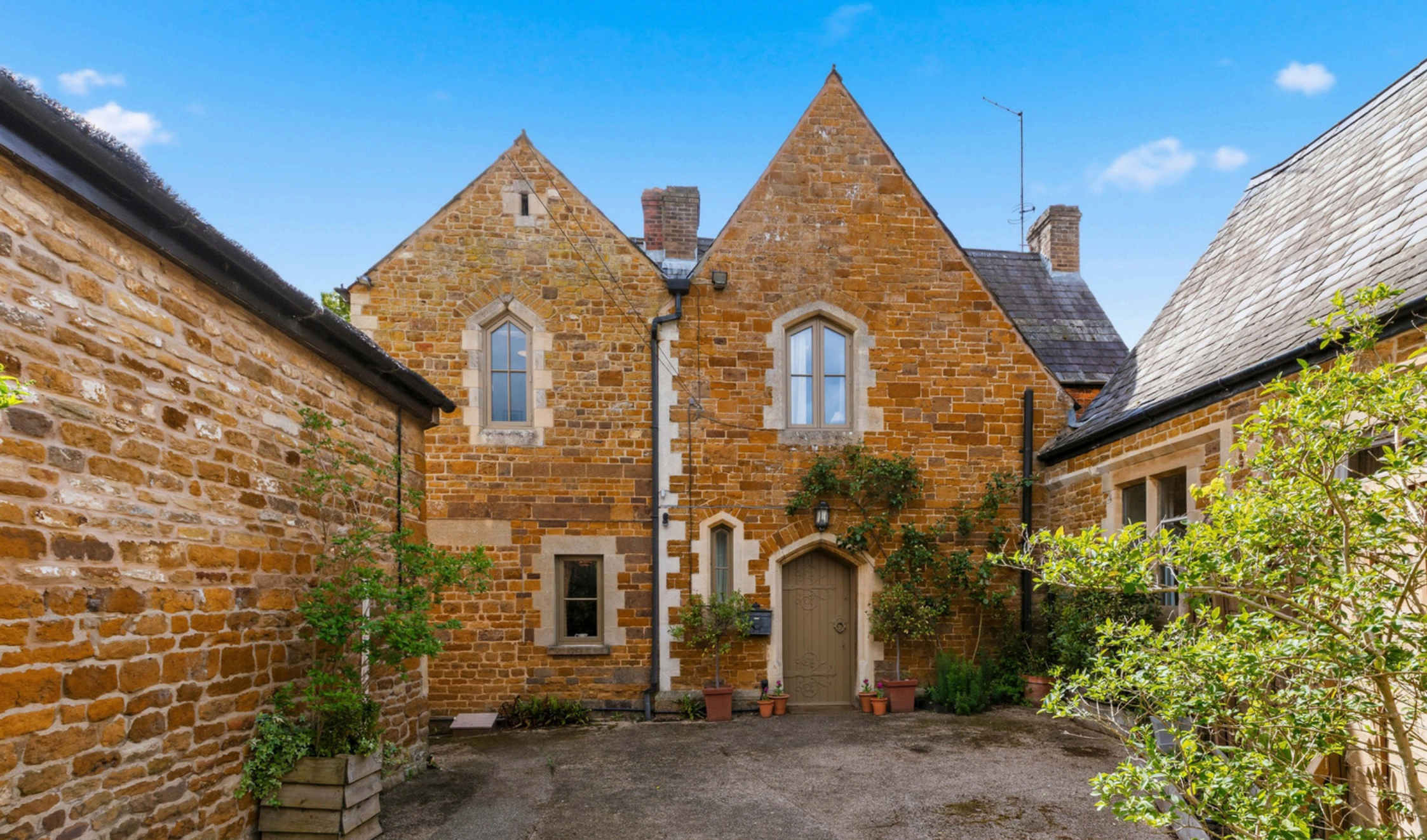
THE OLD SCHOOL HOUSE MAIN STREET, LYDDINGTON